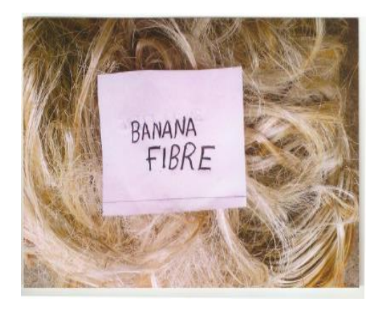
Fig 2.1 banana fiber