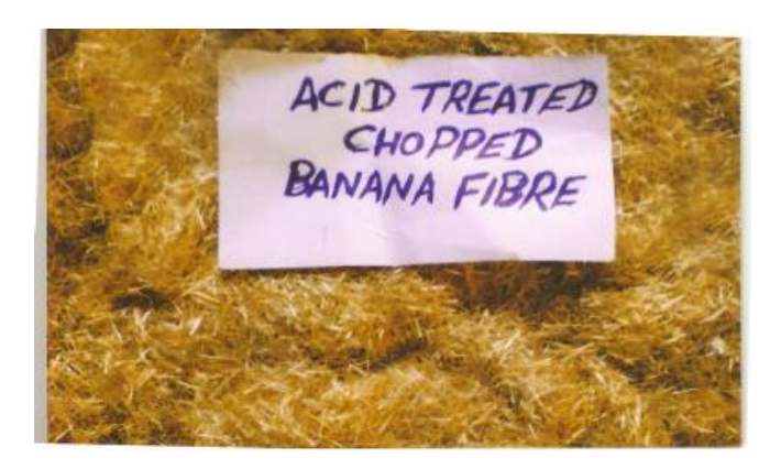
Fig 4.1 acid treated banana fiber