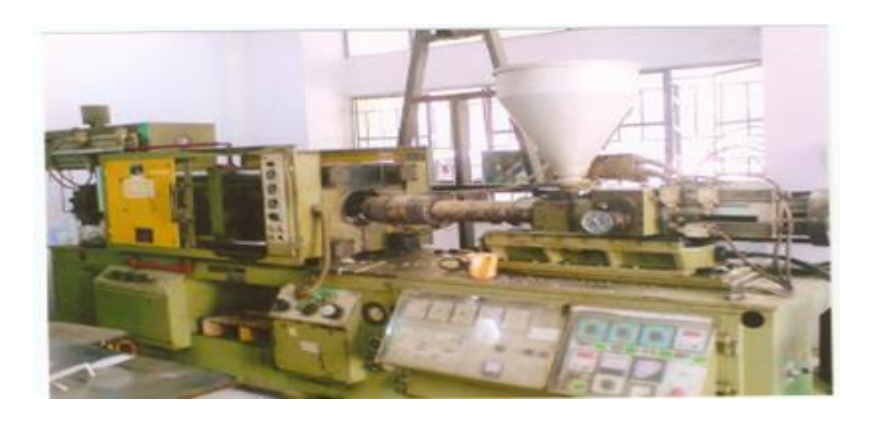
Fig 7.2 injection moulding

The outcome of material is tested for various properties such as tensile, flexural, impact and hardness in the strength of materials laboratory. The outcome material dimension is 15*20*3mm. The output specimen is immersed on the ground water for 24hours.