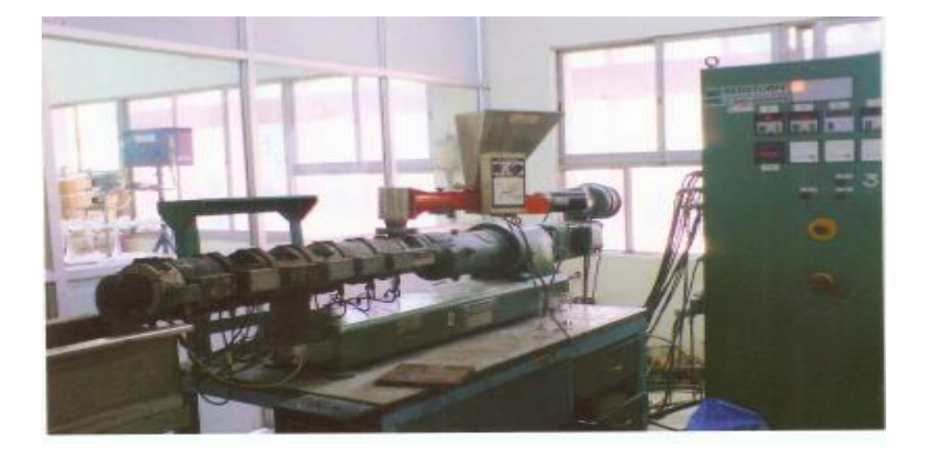
Fig 7.1 extruder machine

The twin extruder machine has the composition of 10% banana and 90% plastic which blends with the help of maleated anhydride. After that, the injection moulding has the molten polymer is mixed with the material under the high pressure.