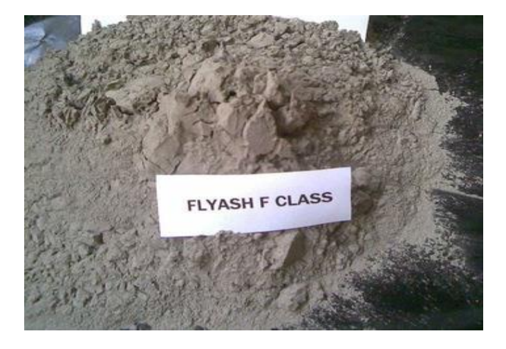
Table: 1 Properties of Class F Fly Ash