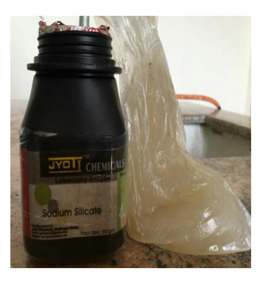
Fig.3 Sodium Silicate