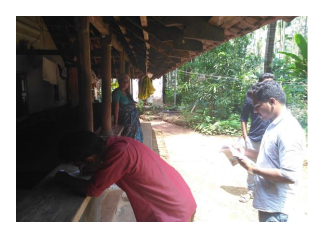
Fig.1 Community survey

through the cummunity survey the data collected from households and also feasibility and preliminary survey carried out.