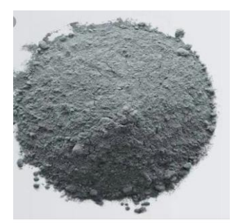
Fig: 4.1.2 class F fly ash

It is the waste obtained as a residue from burning of coal in furnaces and locomotives. In present study class F fly ash is used, it is the burning bituminous coal, it consists of alumina and silica and has higher loss of ignition than class C fly ash and also it has lower calcium content than class C fly ash.