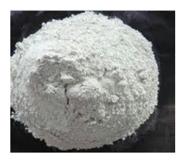
Fig: 4.1.3 GGBS

Ground Granulated Blast-furnace slag is a by- product of iron and steel making from a blast-furnace in water or steam,, to produce a granular, glassy product then that is dried and ground into fine powder.