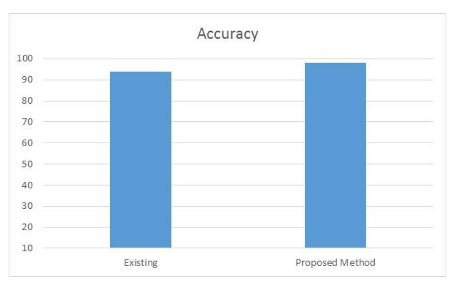
Figure 3: Accuracy Performance Evaluation

As showing in figures 2 and 3, the performance of accuracy is improved in proposed method, performance of processing time is decreased and also the recognition errors are minimized using proposed iris recognition system.