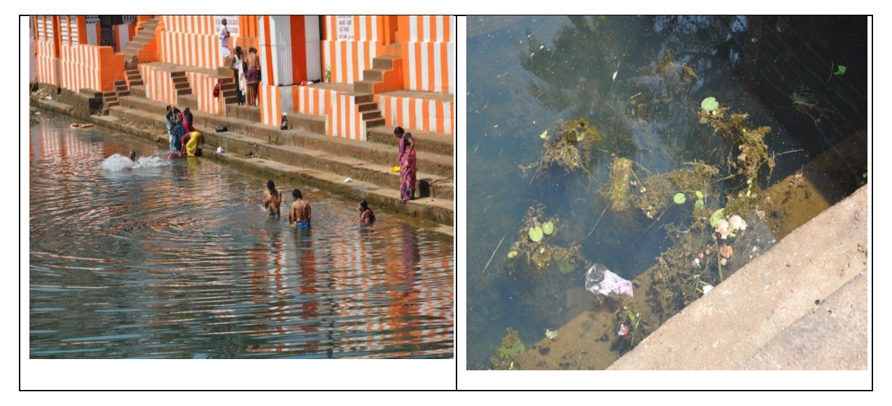
Fig 2: Picture showing sources of contamination in Kotithirta Lake.