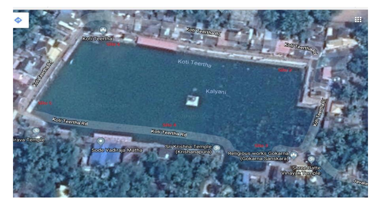
Fig 2: Picture showing the Sampling sites