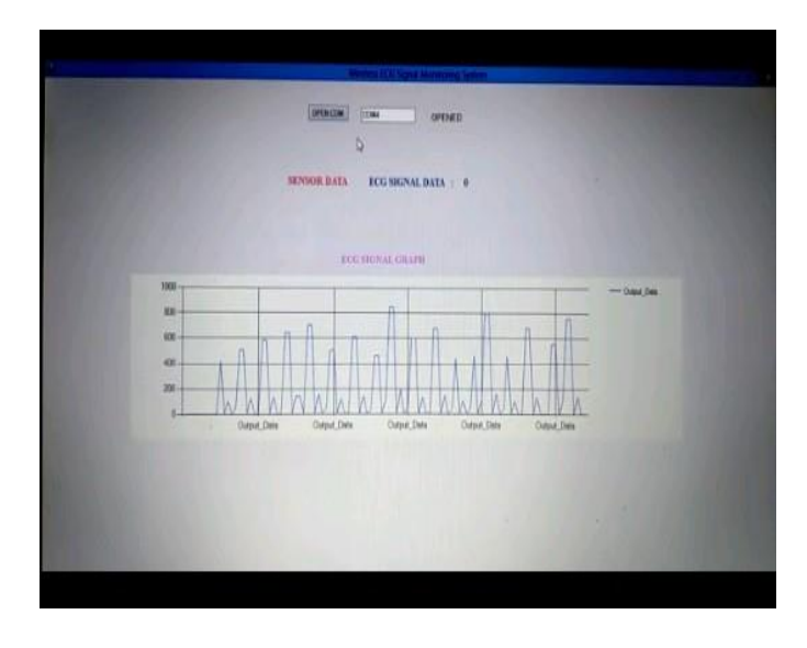
Fig. 3. ECG Graph monitored on PC Application via Zigbee