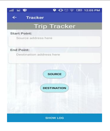
Fig: location tracker