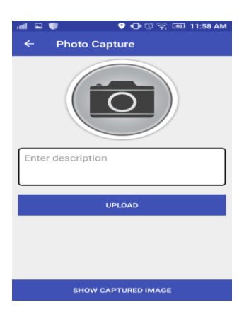
Fig: image capture