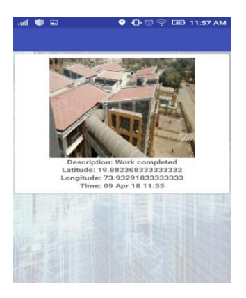
Fig: image capture log