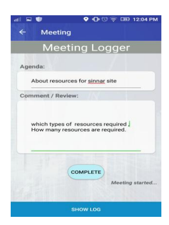
Fig: Meeting logs