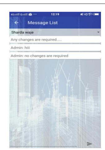
Fig: Message list