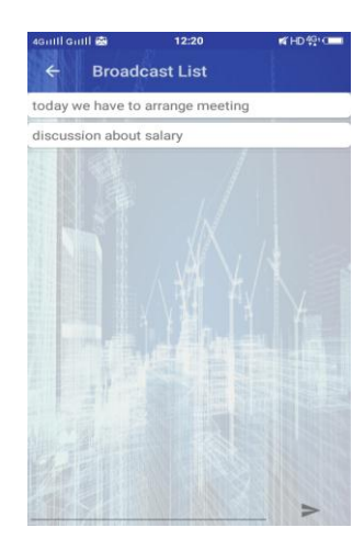
Fig: Broadcast list