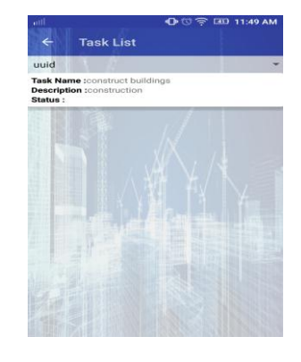
Fig: task list