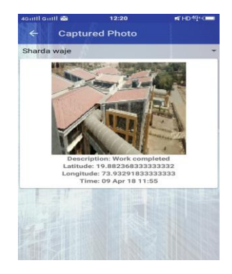
Fig: image logs