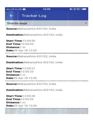
Fig: tracking logs