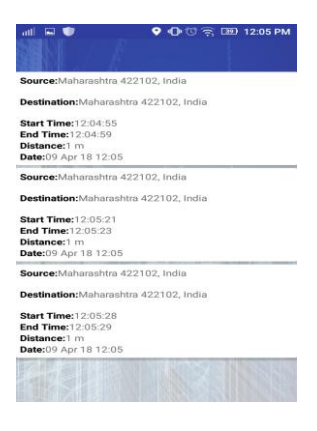
Fig: tracking log