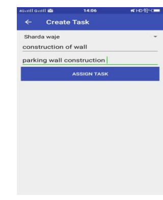
Fig: task assignment