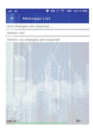
Fig: message list