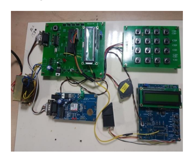
Fig -2: Electronic voting system kit

Initially the power supply is switched on to start the process. A step down transformer is used to convert AC high to AC low voltage and current. The bridge rectifier is used to convert the AC to DC. In order to reduce the noise present in the DC signal the capacitor is used to filter it. The circuit requires only 1A and 12v supply. The PIC microcontroller has 40 pins out of which 32 pins are used for I/O operations (Input and output). Port A is connected to the fingerprint sensor, Port B is connected to the keypad, Port C is connected to the Buzzer and the Port D is connected to the LCD display respectively. Then sim card is inserted in the IOT. Now the fingerprints are registered using the sensor and once the fingerprint is verified with the aadhar card database, an OTP is sent to the receiver unit. This OTP is entered in the keypad. If the entered OTP is correct the vote can be casted by selecting the party else the LCD display shows wrong OTP and the buzzer also notifies the wrong OTP entered. The votes casted by the candidates are stored in the server through IOT cloud.