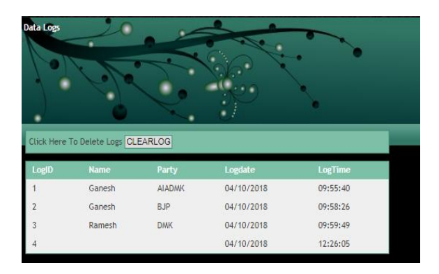
Fig -4: IOT Cloud for results