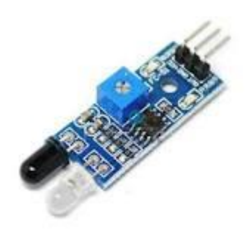
Figure5 : IR Sensor