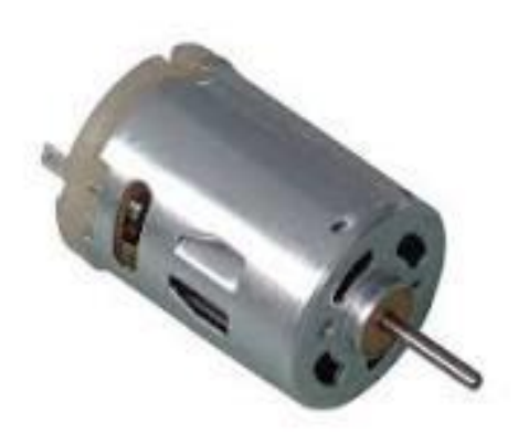
Figure-3: DC Motor.

DC motor is also important in this system. It is useful for rotating the rotor. The DC motor wires carries the current are the space of magnetic field. Magnetic fields are rotating clock-wise and anticlockwise. The 12V DC motor is used in this system. DC motor is used to drive the lift. It support the bidirectional rotation.