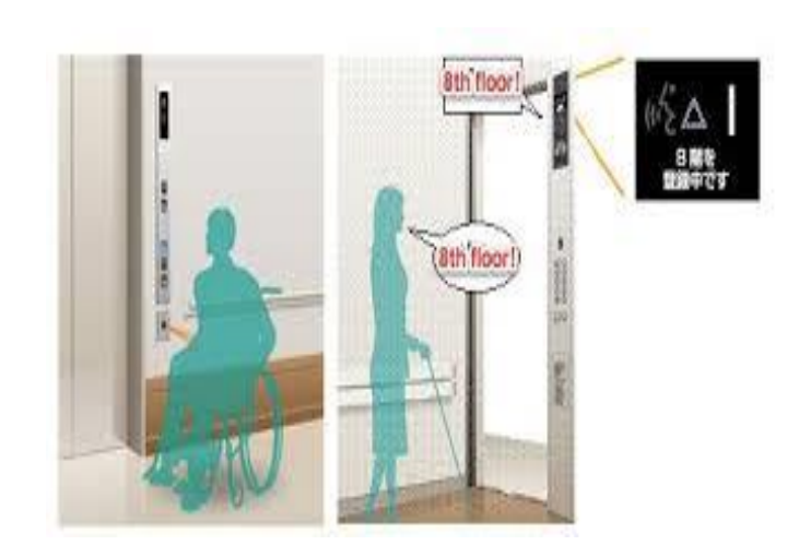
Figure 1: Diagram of proposed system of project