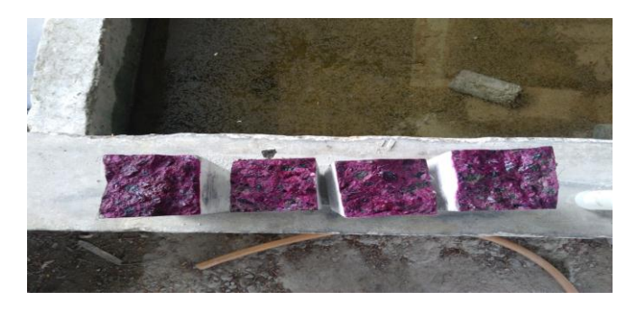
Fig. 1.7 Carbonation Test

This test involves measuring the depth of carbonation of concrete. Specimens with 500x100x100 mm prisms were casted with different mix percentages from 0% to 2% addition of steel fibre. phenolphthalein used as indicator.