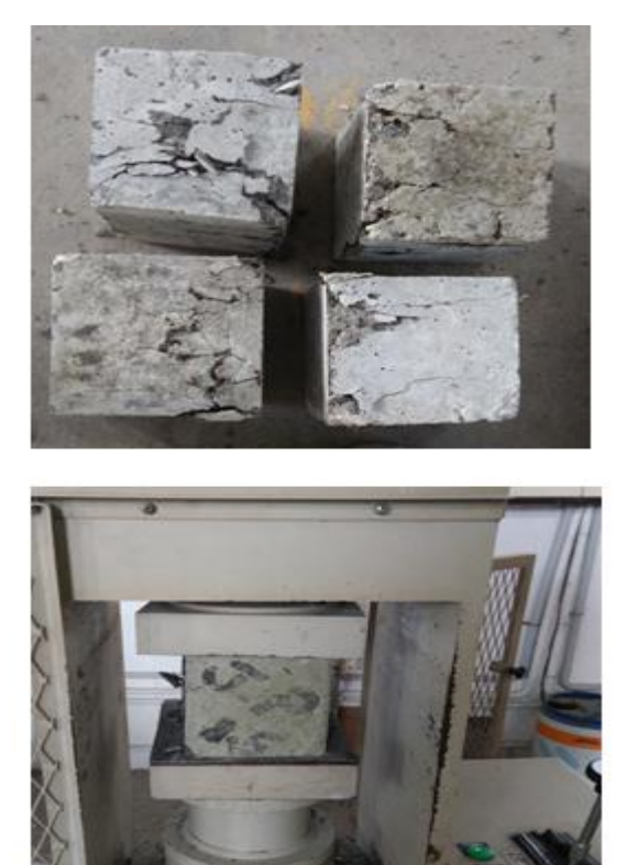
Fig. 1.1 Cube Testing

For cube compressive strength of concrete, 150 x 150 x 150 mm size cubes were used. All the cubes were tested in saturated conditions after wiping out the surface moisture. For each combination, the cubes were tested at the age of 7, 14 and 28 days curing using compressive testing machine of 2000KN capacity.