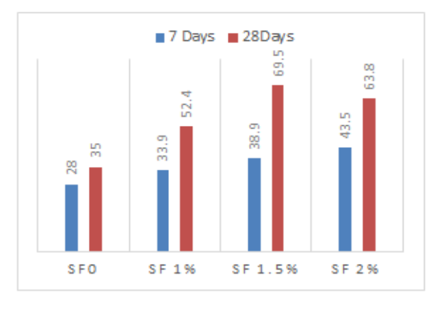
Fig. 1.3 28 Days compressive strength variation

From chart it is clear that increase in compressive strength of cubes having various percentages of Steel Fibre 0, 1%, 1.5% and 2%. Average compressive strength is increased at 1.5% of steel fibre.