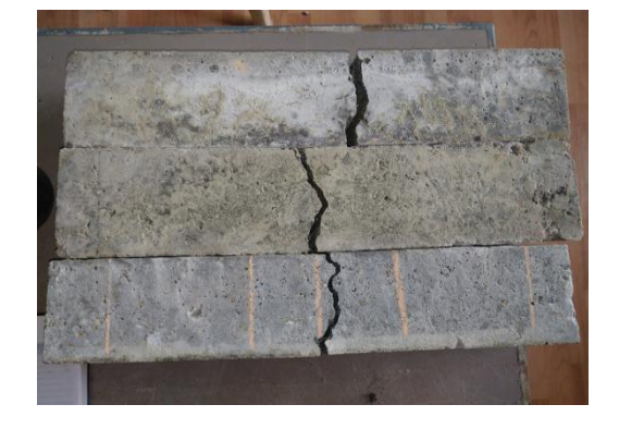
Fig 1.6 Specimen After Testing

From chart, It is observed that increase in percentage of flexural strength for the mix containing SF 2%.