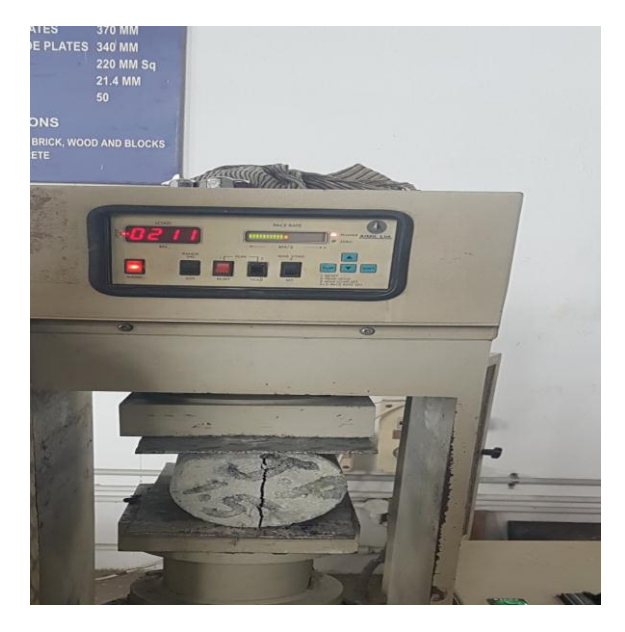
Fig. 1.2 split tensile strength test

This is an indirect test to determine the tensile strength of the cylindrical specimen and it is performed by placing the cylindrical specimen horizontally between the loading surfaces of the compressive testing machine. Standard cylinder size of 150x300 mm are casted and test are conducted after 7, 14 and 28 days curing. The load is applied until the failure of the cylinder along with the vertical diameter takes place.