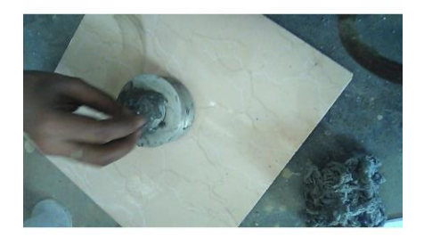
FIG 4.1. MINI SLUMP CONE TEST

This is carried out to find out the early stiffness of mortar mix there by its workability. The prepared mix is poured in the mini slump cone and raised after certain time. Workability is measured in terms of the spread obtained.