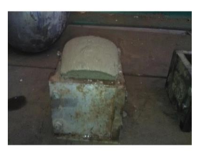
FIG 2.2. CONCRETE MIX AFTER ADDITION OF AI POWDER 2.4 Admixtures

They are materials other than cement, water and aggregates, that is used as ingredient of concrete. They are add to achieve high quality in terms of properties and performance of the concrete.