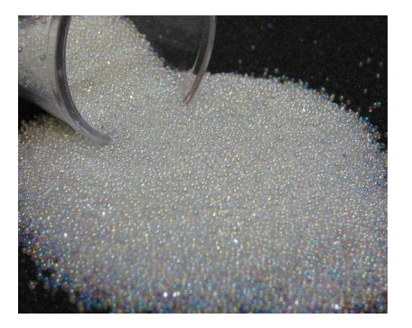
FIG 2.1 GLASS BEADS

The glass beads are our main constituent in our project. We eliminated the coarse aggregate with glass beads. They are made up of glass materials having a specific gravity of 2.3-2.5 and density of 1490 Kg/m<sup>3</sup>.By the addition of glass beads, we obtained a light weight concrete mix with required strength.