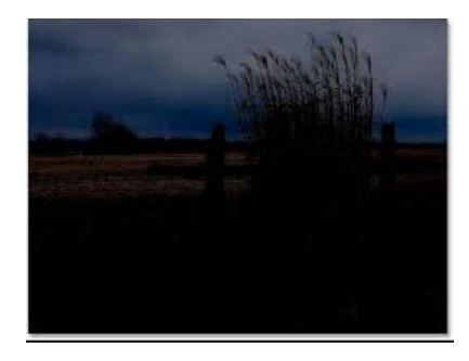
Fig 3.2.1: Grass image before DWT-SVD algorithm

Fig 3.1.2: Sun image after DWT-SVD algorithm