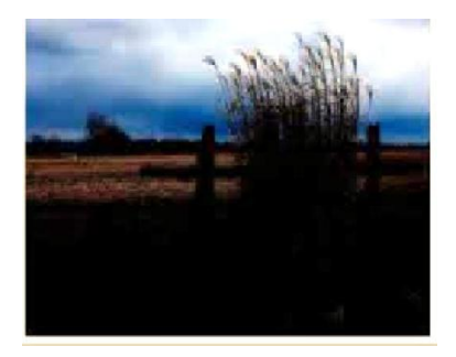
Fig 3.2.2: Grass image after DWT-SVD algorithm

Fig 3.2.1: Grass image before DWT-SVD algorithm