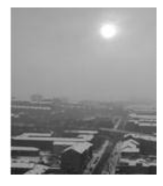
Fig 3.1.2: Sun image after DWT-SVD algorithm