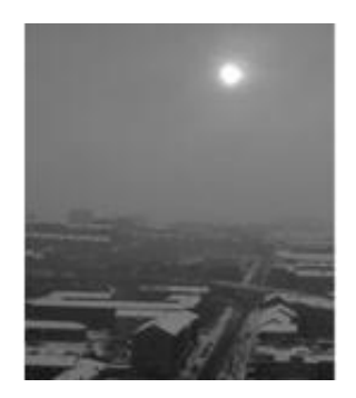
Fig 3.1.1: Sun image before DWT-SVD algorithm