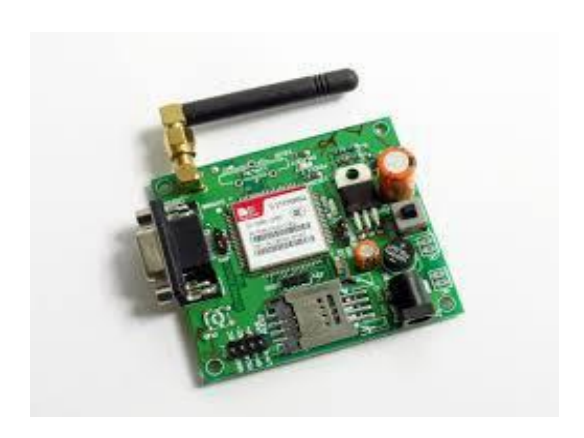
Fig:3 GSM modem

paying for the message delivery. A GSM modem could also be a standard GSM mobile phone with the appropriate cable and software driver to connect to a serial port or USB port on your computer.