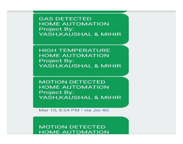
Fig. 2 Alerting massages through GSM

Fig.3 shows the complete implementation of individual sensors explained above. Shown image shows that motion detection system, PIR sensor is mounted near the main door so that it can detect any trespassing activity by any unauthorized person such as thief. Other two safety ensuring sensory system is placed in kitchen area which are gas detection and fire detection sensors, these provides safety from any fire event occurred due to gas leakage or any other reason. Main control system is shown where it is interfaced with LCD screen and GSM module. This whole system is interfaced with above mentioned three sensory systems and shows the appropriate alerting massage on LCD screen. These same messages are forwarded to the authorized user through GSM communication. Near the door for authorized entry in house fingerprint sensor is mounted which is interfaced with another controller and servo motor. This assembly ensures the authorized entry in the house. Fingerprint of authority is already enrolled in system which are used to run servo motor by identify the fingerprint images. Through this servo motor opens the door as fingerprint of authorized person is detected.