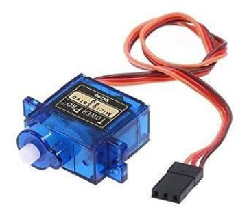
Fig 3: Servo Motor