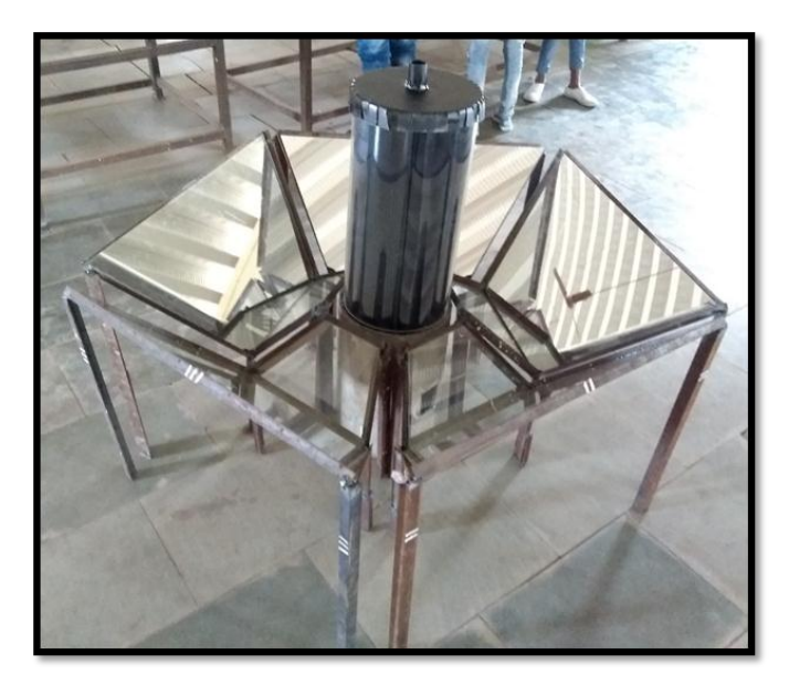
Fig-2: A complete assembly of Actual design.

Here total six number of experiment was conducted from 9 am to 8 pm every day in the month of April. The following measurement has been recorded that is air flow rate, temperature of air inside the annulus, solar radiation, and ambient/atmospheric air temperature. Inlet and outlet air temperature and also wind speed. Variation for wind speed was from 0 to 3 m/s for various days and solar radiation was ranging from 40 to 1000 W/m2. And the average annual normal solar radiation for tested location (Mahesana) was found to be 5.87kwh/m2/day. The experiment was conducted for six different conditions to get the best efficiency. The measured conditions for vertical type solar air heater are tabulated in the table. Here among six experimentations first three were performed with specified mass flow rates that is 0.0221, 0.0279 & 0.0349 kg/sec, that is at a speed of 1.9m/s, 2.4 m/s & 3m/s respectively. From the data extracted from experimentation it is clear that temperature difference between inlet and outlet will increase with increase in solar radiation. From the six cases