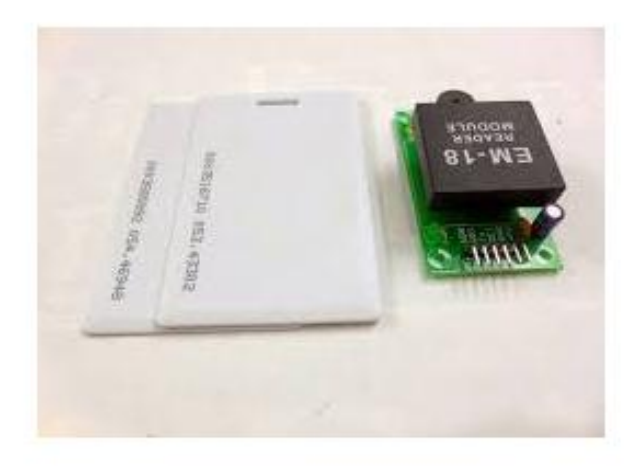
Fig -2: RFID card and card reader

cut off, thereby opens the circuit. So the supply is cut off. In order to recharge the information is passed on to the utility section. Using the recharge mode in the software the card is again recharged for the required amount. The time interval between two successive readings are taken as a month. The maximum limit for a month is fixed to be Rs.50.If there is a balance amount at the end of a month then this amount will be credited to the next month with pulses being set again to zero. The buzzer is provided when the recharge amount is about to be over. The figure 2 shows the RFID card and card reader.