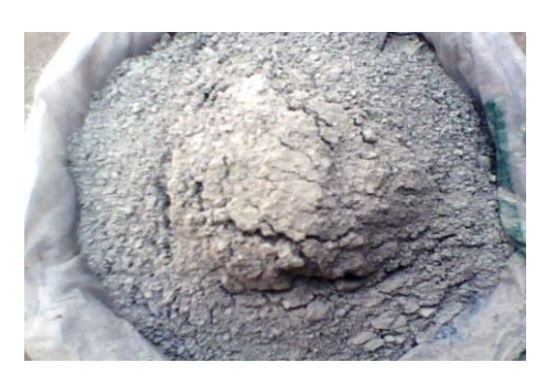
Fig -2: RICE HUSK ASH