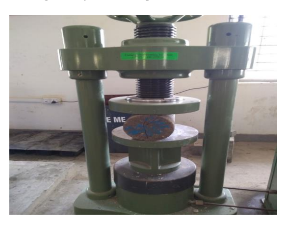
Fig -6 : split tensile strength test set-up

Table -6: split tensile strength comparison of GSA, RHA and SF Added concrete.