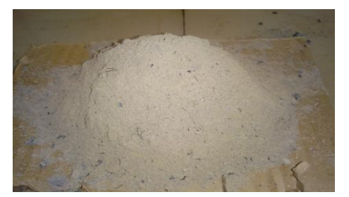
Fig -1: Ground nut shell ash