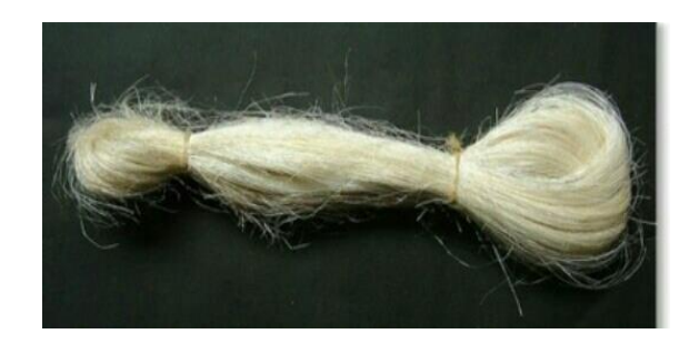
Fig -3: SISAL FIBRE