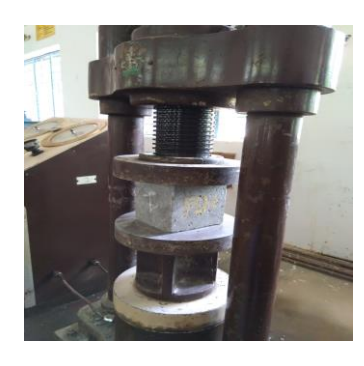
Compression Testing Machine

Compression strength (s)= P/AWhere, P is the maximum load applied to the specimen in Newton A is the area of the specimen in mm.