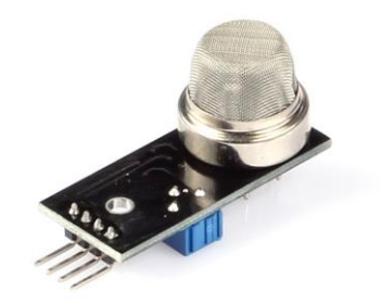
Fig 2.MQ136 sensor

The NodeMcu ESP8266 in Fig 4 is a Wi-Fi module, is capable of either hosting an application or offloading all Wi-Fi networking functions from another application processor. This chip is with full TCP/IP stack and Micro Controller Unit. ESP8266 module comes pre-programmed with an AT command set firmware, which means simply hook this up to your Arduino device. This module is extremely cost effective which consume very less power and reliable in operation. This establishes communication between sensors, controller and user.