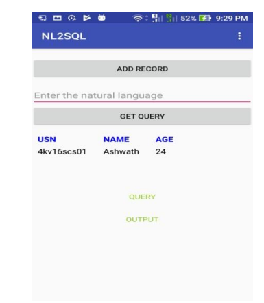
Fig 1: Main Screen

After successful adding of records the user can enter the query in natural language to fetch the information from the database which will be converted to sql queries.