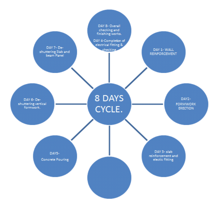
Fig -11: Kumkang formwork work cycle.

Kumkang King Aluminum Formwork System Provides a very fast construction cycle. In which a floor can be erected with in 8 days .