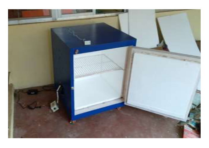
Fig -2: Construction of Storage System.

covered with aluminum sheet from all sides having a total capacity of 56.63 liters. The cabinet is insulated by 0.8 mm thick sun mica sheet from outside for thermal insulation from surrounding and the polystyrene (thermocol) sheet is covered with 20 mm of medium density fiber board for maintaining the rigidity of the cabinet. The door is attached with hinges for better and easy movement of it [2].