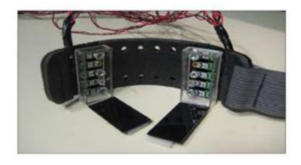
Fig -1: Prototype armband (Outside View) [5]

The vibrations are transmitted by the body upon tapping and the sensing elements detect those vibrations. The acoustic data varies according to the location of tapping. Each tapped surface produces slightly different acoustic information which helps in differentiating input location. The upper and lower sensor package frequencies can be tuned as per the requirements.