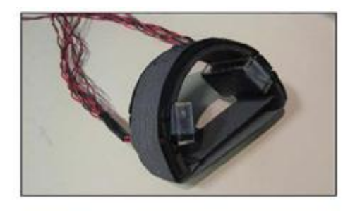
Fig -2: A bio-acoustic sensing array in an armband. (Inside View)[5]