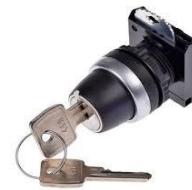
Fig 3: Key Switch

A key switch (sometimes called a lock switch) is a switch that can be activated only by the use of a key. They are usually used in situations where access needs to be restricted to the switch's functions. Key operated switch is mainly used for security and safety purpose. It operates as that of a conventional switch with rotary action. It can be activated only by using a key. Different types of key switches are available on the bases of ampere rating. The main advantage of using key operated switch instead of normal switch is to avoid accidental application of normal switch while riding the vehicle. It also covers child safety and operation by unskilled users.[3]