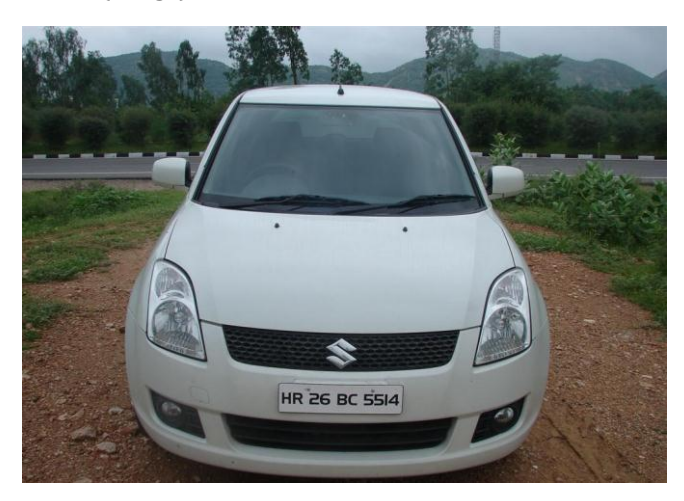
Figure 2:-Car Image