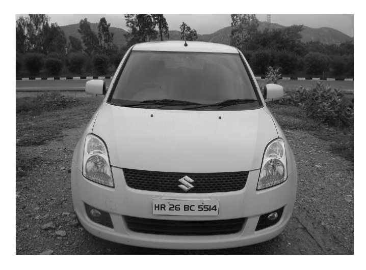
Figure 3:-RGB to Gray Format

This is second phase in the system. We will work on the image taken as the input from above step. It is in RGB format. We will be converting that image into gray scale using MATLAB.