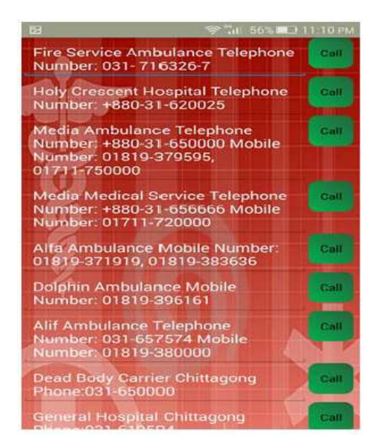
Fig -5: Emergency call system

In case of emergency when an ambulance or doctor is not at hand, this application can help by providing quick links for calling a doctor or an ambulance. There is an option for emergency calling in this app which takes just a tap to make a call to the desires service as shown in Fig. 5.