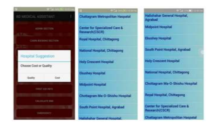
Fig -3: Hospital suggestion

In this application there is a special element called healing hospital suggestion. Here an exhaustive proposal of healing hospitals can be got. It presents two classes of proposal to the client. To begin with is quality based, and second is taken a cost based. The first alternative sorts the doctor's facilities by the offices they accommodate like, the quantity of full time specialists, number of pro specialists, number of activity theaters, number of specialists and client rating from online destinations. In case of cost based suggestion, the application sorts the hospital based on their cabin fee per day. This is demonstrated in Fig 3.