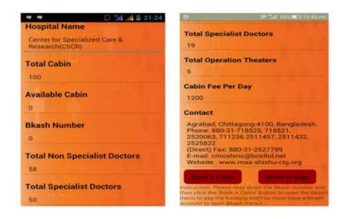
Fig -2: App displaying details for cabin

This application is produced in android OS. The first page offers clients a rundown of highlights. It has sections for administration, hospital information, cabin booking in hospital, section for appointment making with doctor, section for emergency health care, section for aid and medication information, BMI index calculation section, medicine reminder section and hospital suggestion section. The admin section provides an easy way to create and update the hospital and cabin booking information. An administrator will be given a password to login to admin section. After successful login, admin can update hospital information such as list of specialist doctors, number of cabin, amount of charge for service, facilities provided by a hospital, information about Operation etc. Furthermore, an admin can see who booked cabin with payment information. Admin will use the payment information to verify the identity of the one who booked cabin. Demonstrated in fig 2.