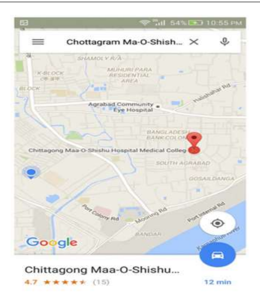
Fig -4: Hospital location

In case of emergency when an ambulance or doctor is not at hand, this application can help by providing quick links for calling a doctor or an ambulance. There is an option for emergency calling in this app which takes just a tap to make a call to the desires service as shown in Fig. 5.