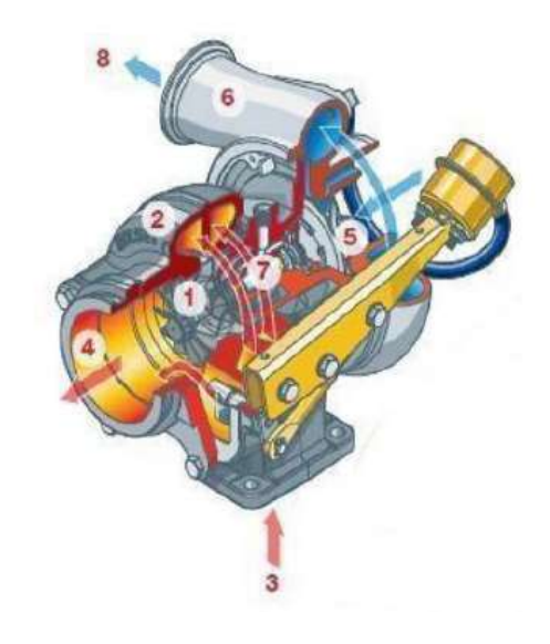
Fig -1: Conventional Turbocharger

Conventional turbocharging systems basically make use of a turbine-compressor arrangement in the exhaust line of the engine where the exhaust gases are used to rotate the turbine that drives the compressor which in turn compresses the inlet air to the required boost pressure.