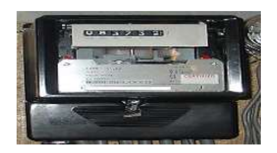
Fig: Traditional Meter Read

missing ills, absence of consumer etc. Even though these conventional meters were replaced with more efficient which reduces long queue and saves time. electronic energy meters these problems still persists. So a 2.6 Web Page Creation system which will provide the bill in users mobile will be more suitable in the current scenario.