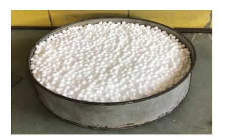
Fig -2: EPS Beads