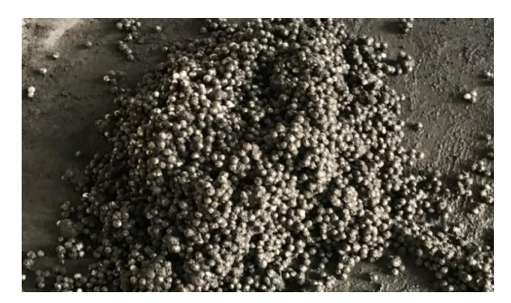
Fig -1: Floating Concrete

This Project investigates the properties of the Floating concrete by using a EPS Beads. In this technique the EPS Beads are used for preparation of the Floating concrete and density is reduced to attain the maximum efficiency, whereas the self weight of the structure is minimized thereby reducing the dead load on structure. Expanded Polystyrene (EPS) is one of the most widely used plastics, the scale being several billion kilograms per year. The polystyrene foam is a thermoplastic material obtained by polymerization of styrene. The use of expanded polystyrene in construction has lot of advantages compare with the use of conventional materials which results in sustainable future. The use of EPS Beads also reduces the environmental hazards that causes during its disposal. Most of this kind of waste is late unnoticed and they will lead to global warming.