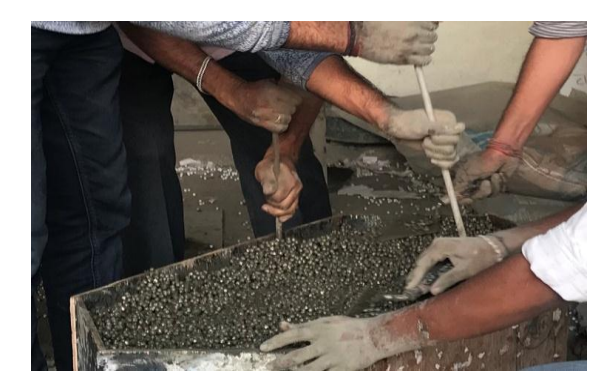
Fig -4: Showing Placing and Compaction of Concrete

Before the placing the concrete mould was cleaned and oiled to prevent the formation of bond between concrete and mould. The fresh concrete filled into the mould of boat in three layer uniformly with hand compaction, sufficient blows were given after adding each successive layer. In case of concrete with EPS Beads Vibration makes segregation that's why more preference is given to hand compaction method. After the compaction has been completed, the excess concrete was removed from the mould with the help of trowel and the surface was leveled.