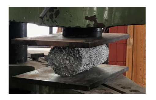
Fig -9: Split Tensile Strength Test