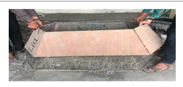
Fig -5: Demoulding