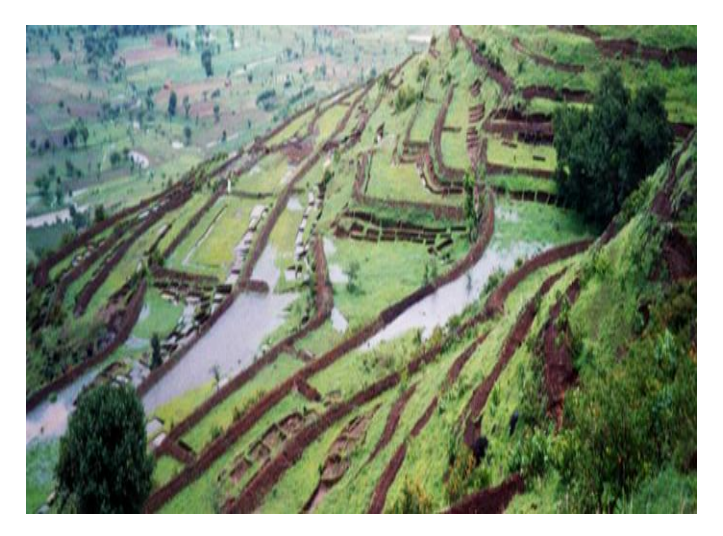
Fig No: 1 (Watershed Management)

Therefore, watershed management is the process of guiding and organizing land use and use of other resources in the watershed to provide desired goods and services without adversely affecting soil and water resources. Embedded in this concept is the recognition of the in this concept is the recognition of the inter-relationships among land use, soil and the linkages between uplands and downstream areas.