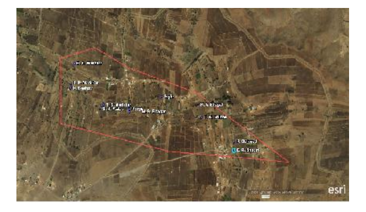
Fig No: 3 (Satellite image of studied area from Arc GIS)