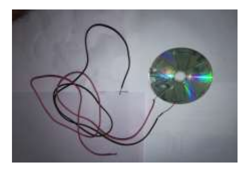
Fig. no. 1 : Bonding between CD & copper wire

Fig. no. 1 shows the binding of copper wire and CD