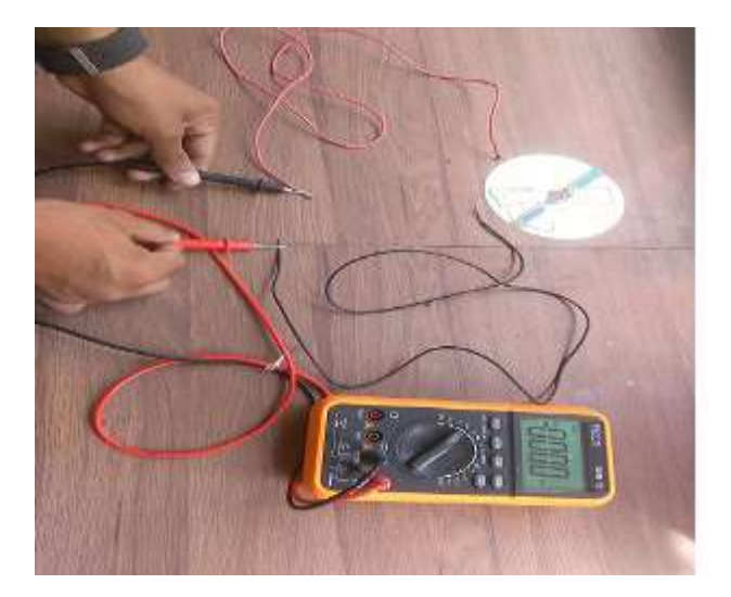
Fig no. 2 : Testing of material used