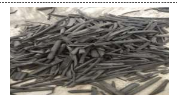
Fig -1: Tyre waste