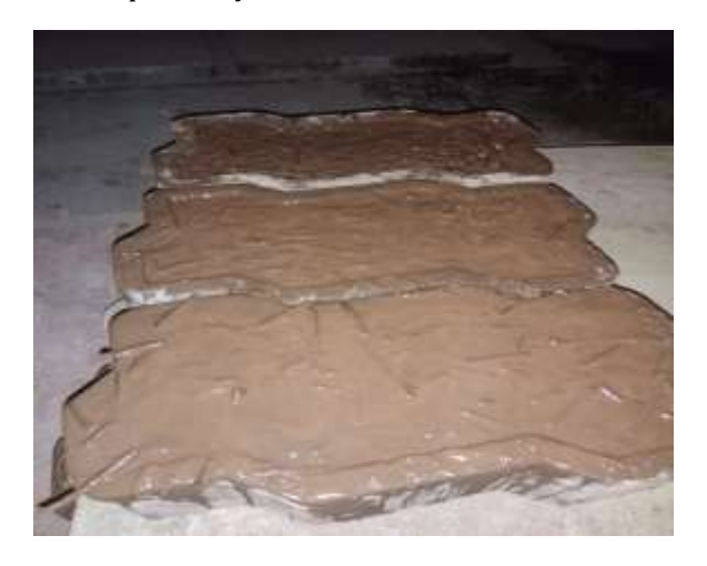
Fig -2: manufacturing of bloks.

For this project we brought the materials from the store and we casted the paver blocks by compression mould machine on the site itself with the help of their equipment's. All materials are propery mixed and pored in moulds. Moulds are compacted by table vibrator.