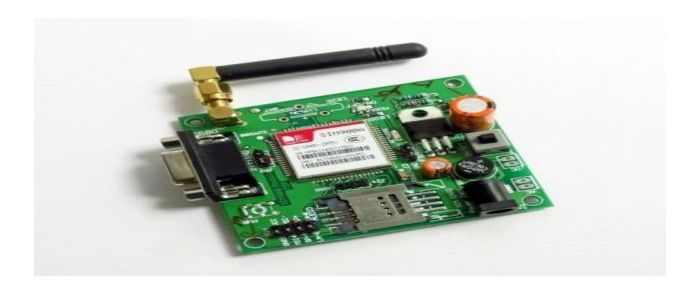
Figure 3- GSM

GSM/GPRS module is used to develop correspondence between a PC and a GSM-GPRS system. Overall System for Mobile correspondence (GSM) is a plan used for adaptable correspondence in most by far of the countries. Overall Packet Radio Service (GPRS) is an increase of GSM that engages higher data transmission rate. GSM/GPRS module contains a GSM/GPRS modem together with control supply circuit and correspondence interfaces (like RS-232, USB, et cetera) for PC. The MODEM is the soul of such modules. GSM/GPRS MODEM is a class of remote MODEM devices that are planned for correspondence of a PC with the GSM and GPRS orchestrate. It requires a SIM (Subscriber Identity Module) card just like PDAs to incite correspondence with the framework. Furthermore they have IMEI (International Mobile Equipment Identity) number like phones for their recognizing verification.