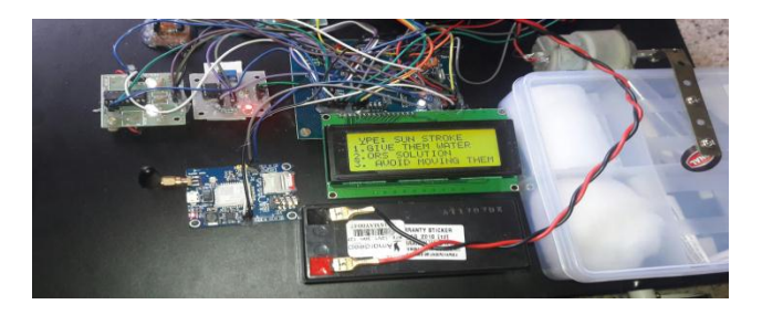
Figure 7- First aid procedure is displayed on lcd

The whole framework is appeared in the above picture, which is mounted with the microcontroller in the middle comparing with gsm, heartbeat sensor and temperature sensor with the dc engine and furthermore it comprises of restorative pack. Subsequently android application is formulated and worked through gsm. Through the application the patients beat rate and the temperature will be sent to the specialist.