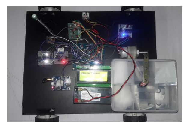
Figure 5- Experimental model of Robotic ambulance

The steady usage of dispatching Ambubot that will touch base to the premises, conveys with an a crisis message and current position of casualty will be created by both of two applications, which are finished by sensor and cell phone application. These information will be assessed and there upon transmitted consequently to specialist promptly after a sudden wellbeing capture happens. The greater part of individuals utilize savvy cell phone. In this way the advancement of cell phone application associated with Ambubot is advantageous on the grounds that it can give ontime medicinal care to the casualty.