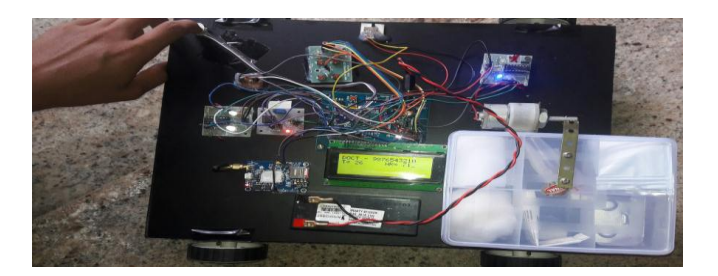
Figure 6- Temp and heartrate is being displayed on lcd