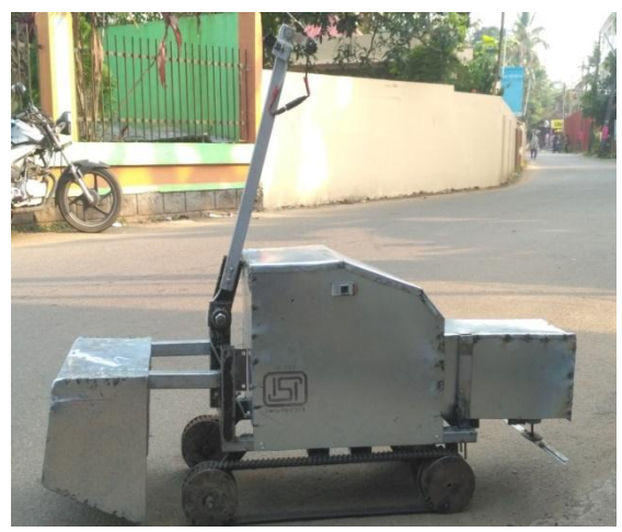
Fig - 2 : Actual Design