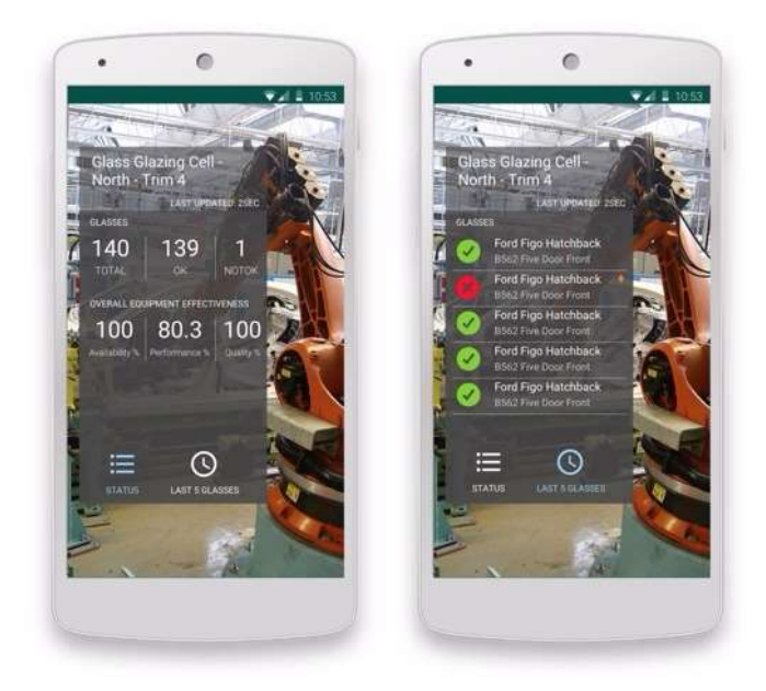
Fig -4: AR Application running on Android phone