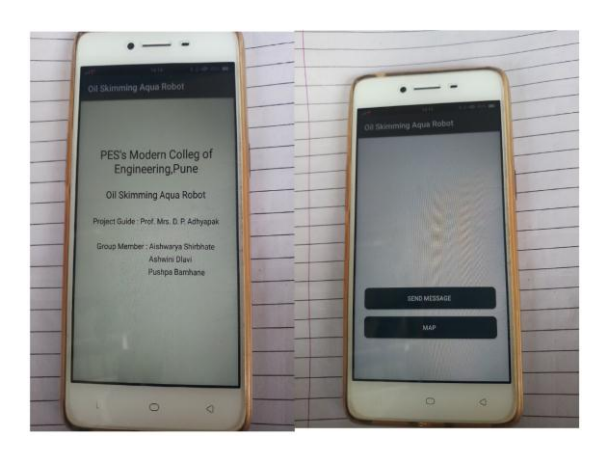
Figure 4: Snapshot of Android application