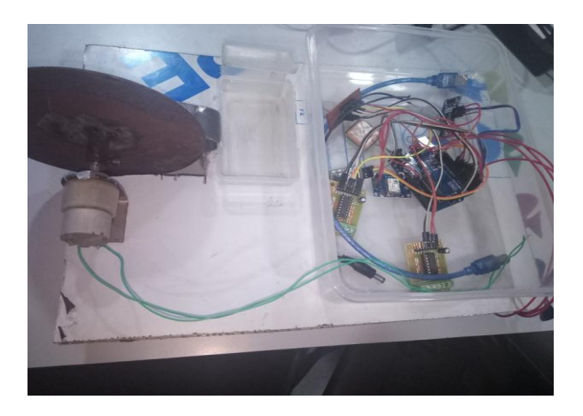
Figure 3: Snapshot of oil skimming aqua robot