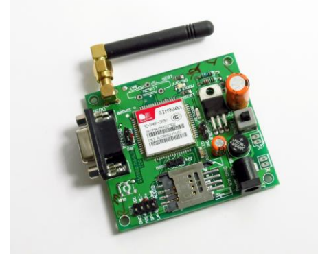
Figure 1: GSM module

A GSM modem is a specialized type of modem which accepts a SIM card, and operates over a subscription to a mobile operator, just like a mobile phone. From the mobile operator perspective, a GSM modem looks just like a mobile phone. A wireless modem behaves like a dial-up modem