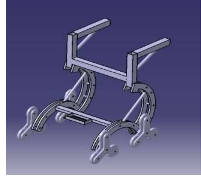
Figure 3.3 cad design of mobility assist

This project consists of frame, dc motor, battery, screw rod, pneumatic cylinder, wheel and bearing. The frame is mounted with the step climbing wheel. The pneumatic cylinder is mainly used for the purpose of lifting the climber while moving up and down the steps. The screw rod is mounted with the Dc motor and the Dc motor get the power from the battery. When the Dc motor is ON, the screw rod gets rotated forward and backward direction for lifting the person easily. The screw rod moves forward and backward when there is a variation in the height of the steps.