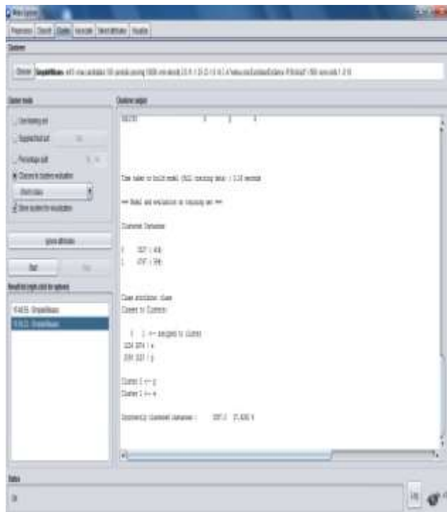
Fig.3.3 Result for K-Means Algorithm