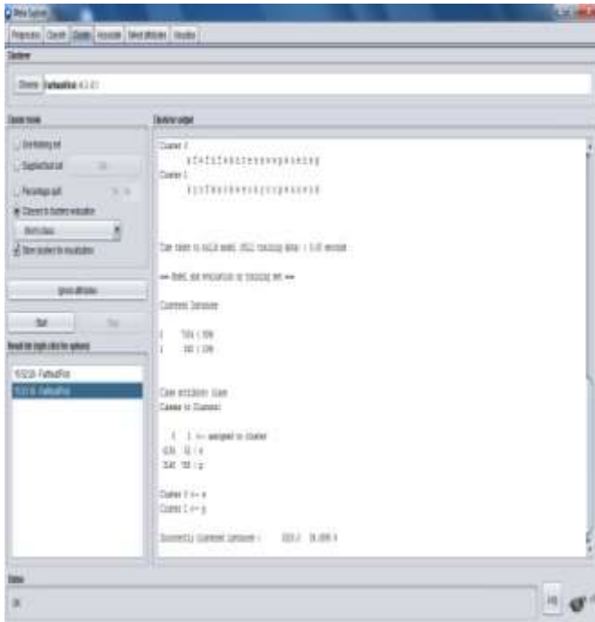
Fig.3.2. Result for Farthest Fast Algorithm