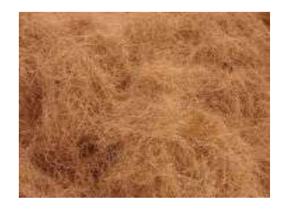
Fig.2 Coir Fibre

The basic tests such as specific gravity and fineness modulus test were conducted for coir fiber sand and the results are as shown in table 2.6.