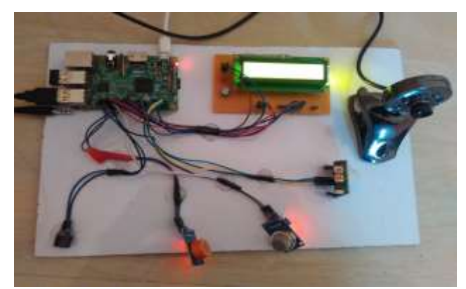
Fig -6: Experimental Setup

The Raspberry PI controller fulfills the requirements of cost-sensitive, high volume of consumer electronic applications. The advance controller consists of 512 MB with nine black plastic case, also 46 megapixel camera is used to capture an fire image. RPI KIT and camera to USB as shown below: