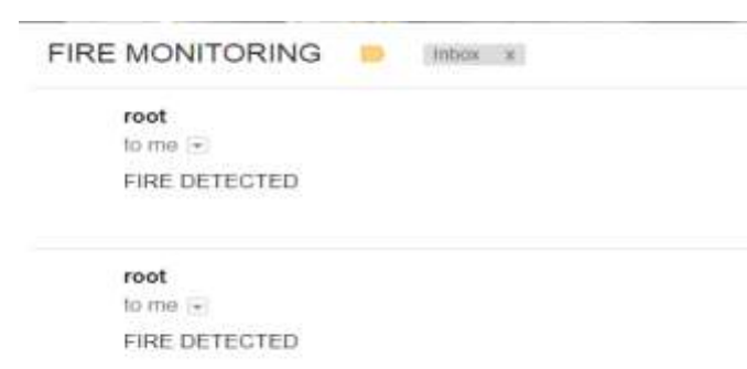
Fig -8:Fire Detects Message on Email

The above figure shows the output on the monitor Basic fire is for small fire. the counter is ON, whenever fire is larger than threshold then fire detects Email send to the operator.