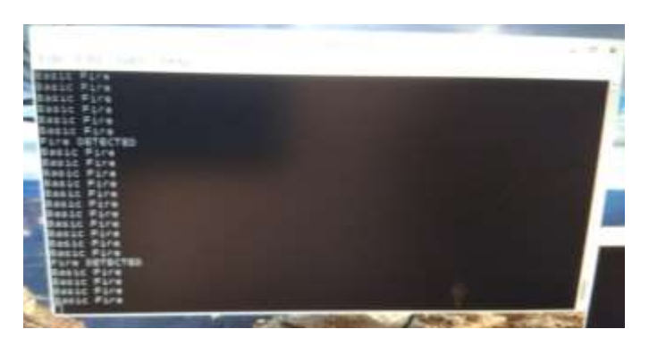
Fig -7: Fire Detects on Monitor Screen