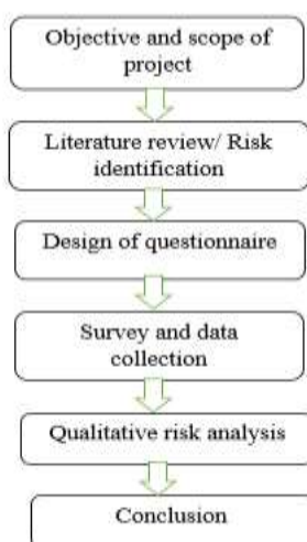
Fig. 3.1 Methodology adopted for project

This investigate, passed through the following stages in figure: