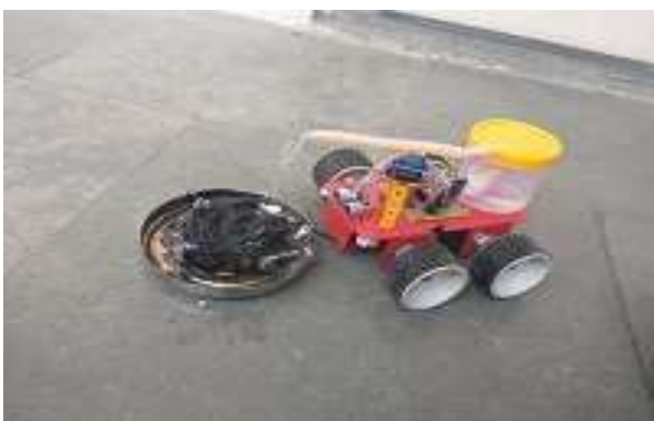
Fig -8:Fire is Extinguished

In the fire-fighting robot project, the main aim was to develop a robot which will detect fire and extinguish it. In this project obstacle is detected by using ultrasonic sensor, fire is detected by temperature sensor and robot is moved to target using Bluetooth communication. A robot which is result of this project communicates with mobile application through Bluetooth and with microcontroller and other hardware using serial port communication. Micro-controller can handle both analog and digital data received from mobile app and hardware to detect fire and extinguish it. This project can be used in day today life if more professionals are selected. It can be used in markets, malls, stores, companies and even at homes. In this project fire is extinguished by water which is stored in water tank which is mounted on robot, instead of this we can carry water pump. For providing more safety we should add some obstacle detector sensors and temperature sensors to detect fire at left and right side.