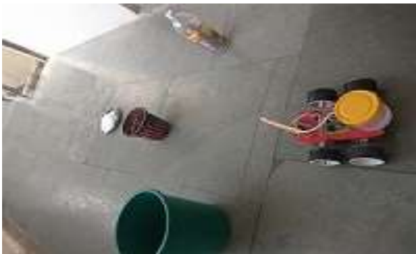
Fig 5-Setup for testings