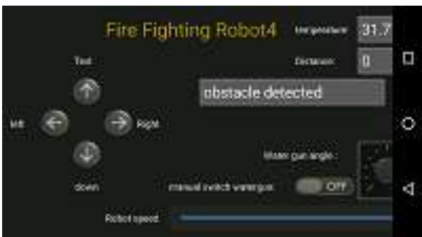
Fig -7:when Obstacle is detected