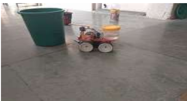
Fig -6:Obstacle Detected