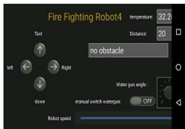
Fig -4: No obstacle is detected