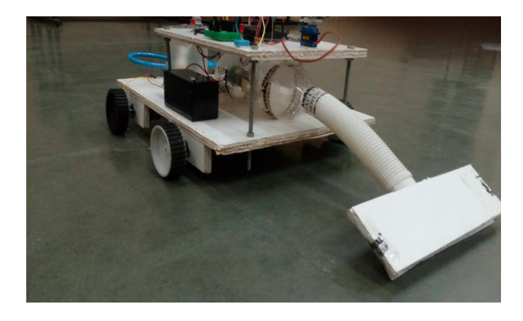
Fig -2: Layered View of the Robot

© 2018, IRJET | Impact Factor value: 7.211 | ISO 9001:2008 Certified Journal