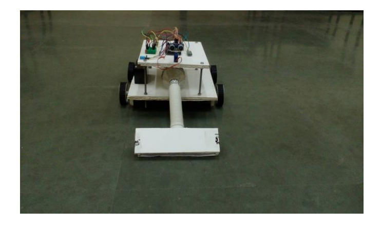
Fig -1: Front View of the Robot and the Vacuum Suction Pump

The plan is to implement each of our sensors individually on the robot. In the next step, all the components will be then linked together via a microcontroller. The software will then be embedded on the microcontroller to perform the control operations.