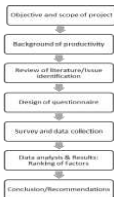
Fig 3.1 Research stages

This investigate, passed through the following stages in figure: