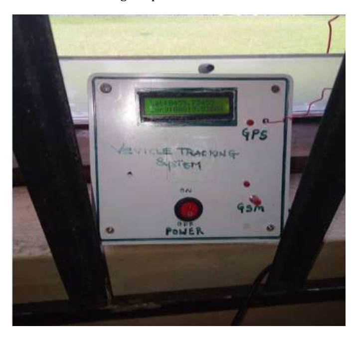
Fig - 4: Image of the complete system assembly with LCD showing the location of the vehicle