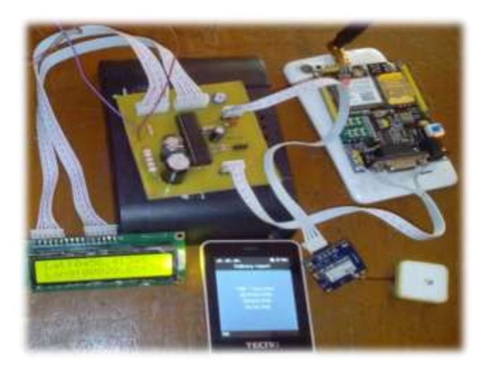
Fig-3: Image of the complete system assembly with LCD showing the position of the vehicle

Fig. 3 shows the assembling of the different modules of the proposed vehicle tracking system and Fig 4 shows the completely cased system. In testing, we fixed the completed vehicle tracking device in a car as shown in Fig. 4 and allow the car to be driven away to a different location. We then send an SMS with a registered mobile phone to the GSM modem with a registered SIM card with a command" TRACK VEHICLE" and an SMS was received by the mobile phone. The SMS gave the latitude, longitude and time as shown in Fig. 5.