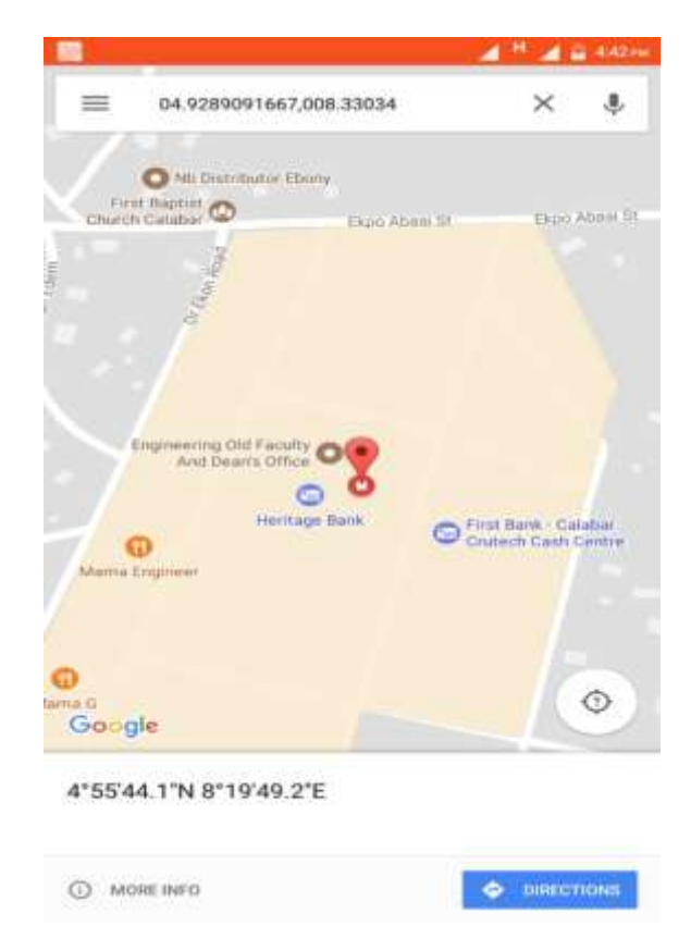
Fig-6: Google map location of the vehicle and tracking system