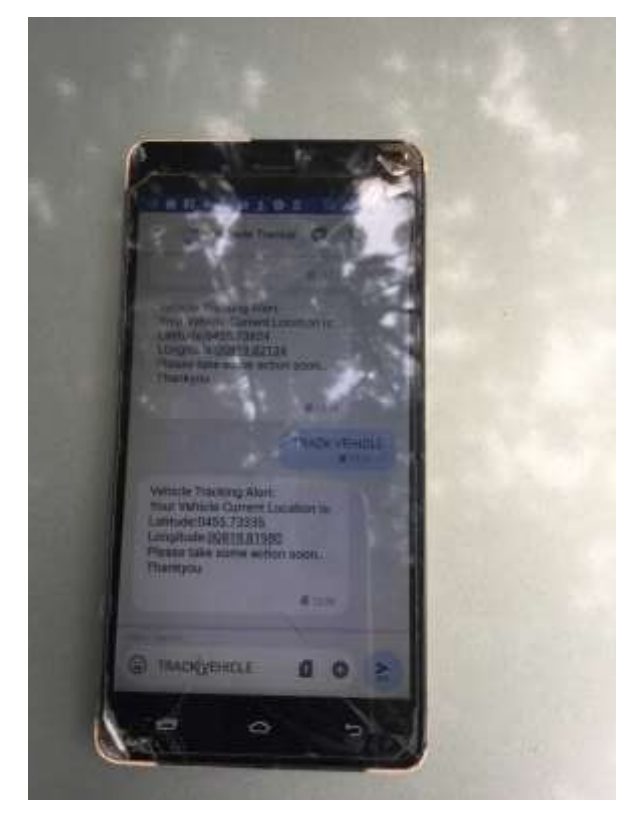
Fig-5: Owner's mobile phone Screenshot of returned SMS to a TRACK VEHICLE request

This system shows the location of vehicle on the LCD connected to it to ensure the working condition of the microcontroller.