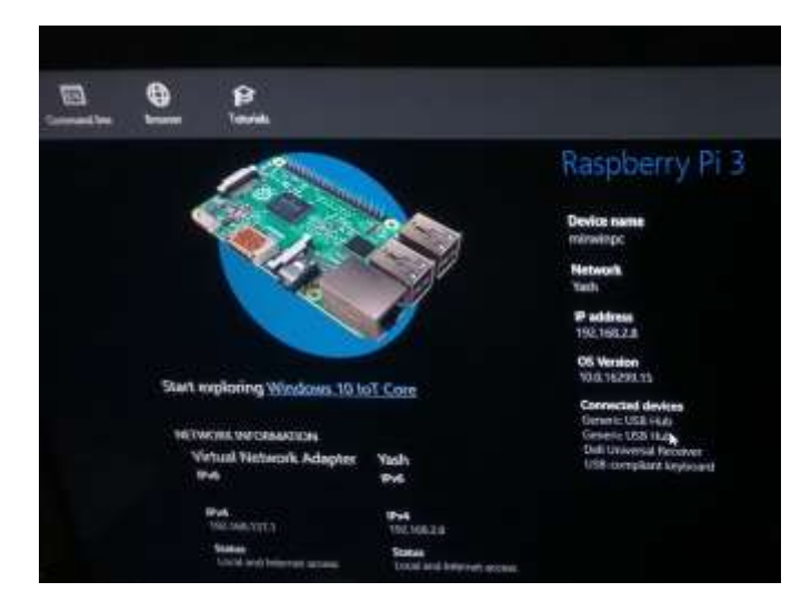
Fig 5: Raspberry Pi Configurations