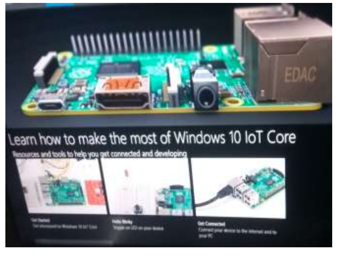
Fig 4: Windows OS in Pi