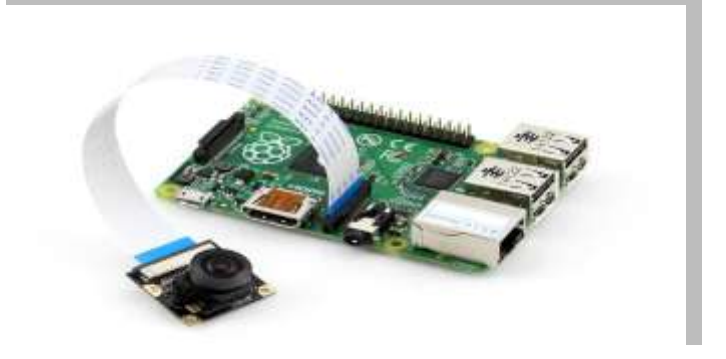
Fig 1: Raspberry Pi with Pi Camera Attached

Raspberry pi is used as a tool to promote the code for accepting the input from the door bell and sending the message and picture of the stranger at the door to the house member's email. This is the major hardware tool used for this project.