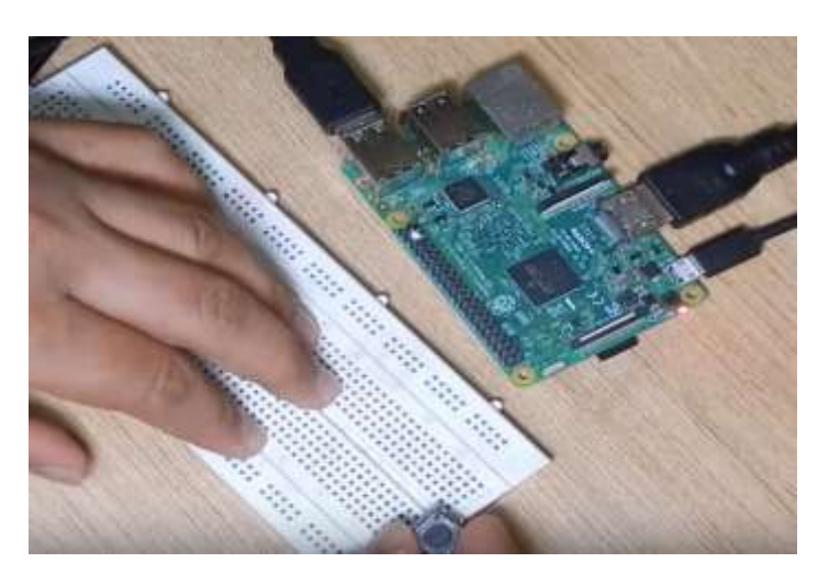
Fig 3: Establishing Connections