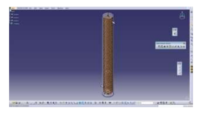
Figure 2 CATIA model of heat exchanger

International Research Journal of Engineering and Technology (IRJET)e-ISSN:Volume: 05 Issue: 05 | May 2018www.irjet.netp-ISSN: