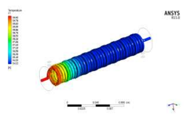
Figure 3. Temperature contour